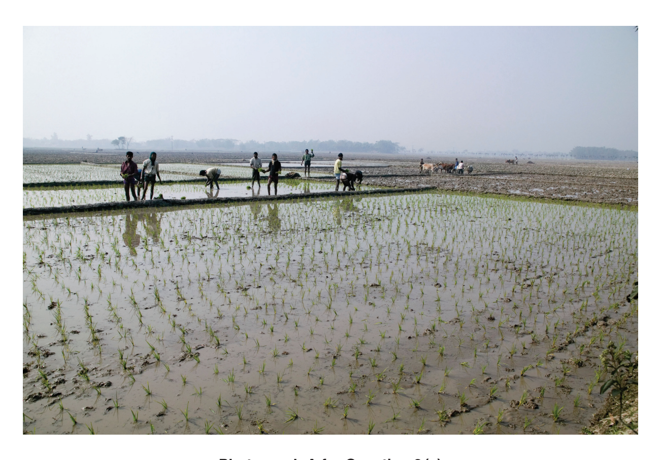
Photograph A for Question 3(a)