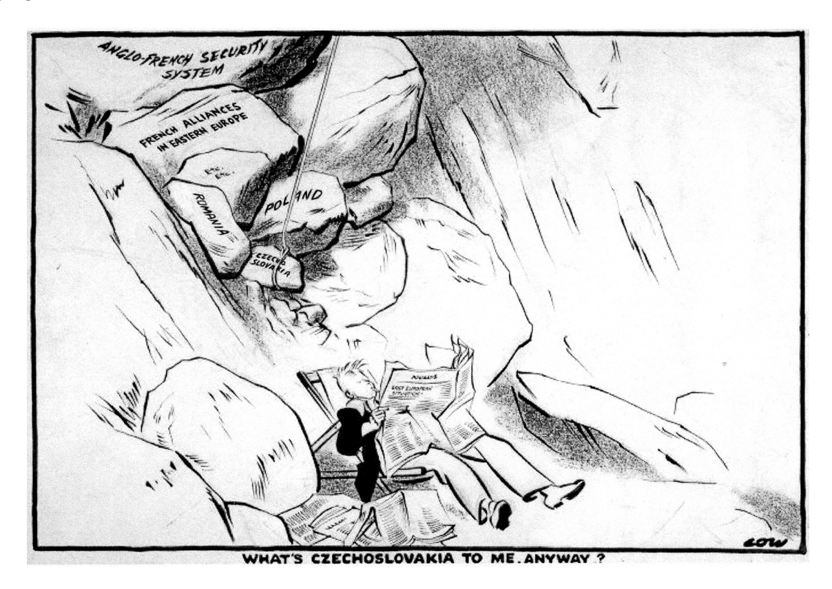
A cartoon published in Britain in July 1938.