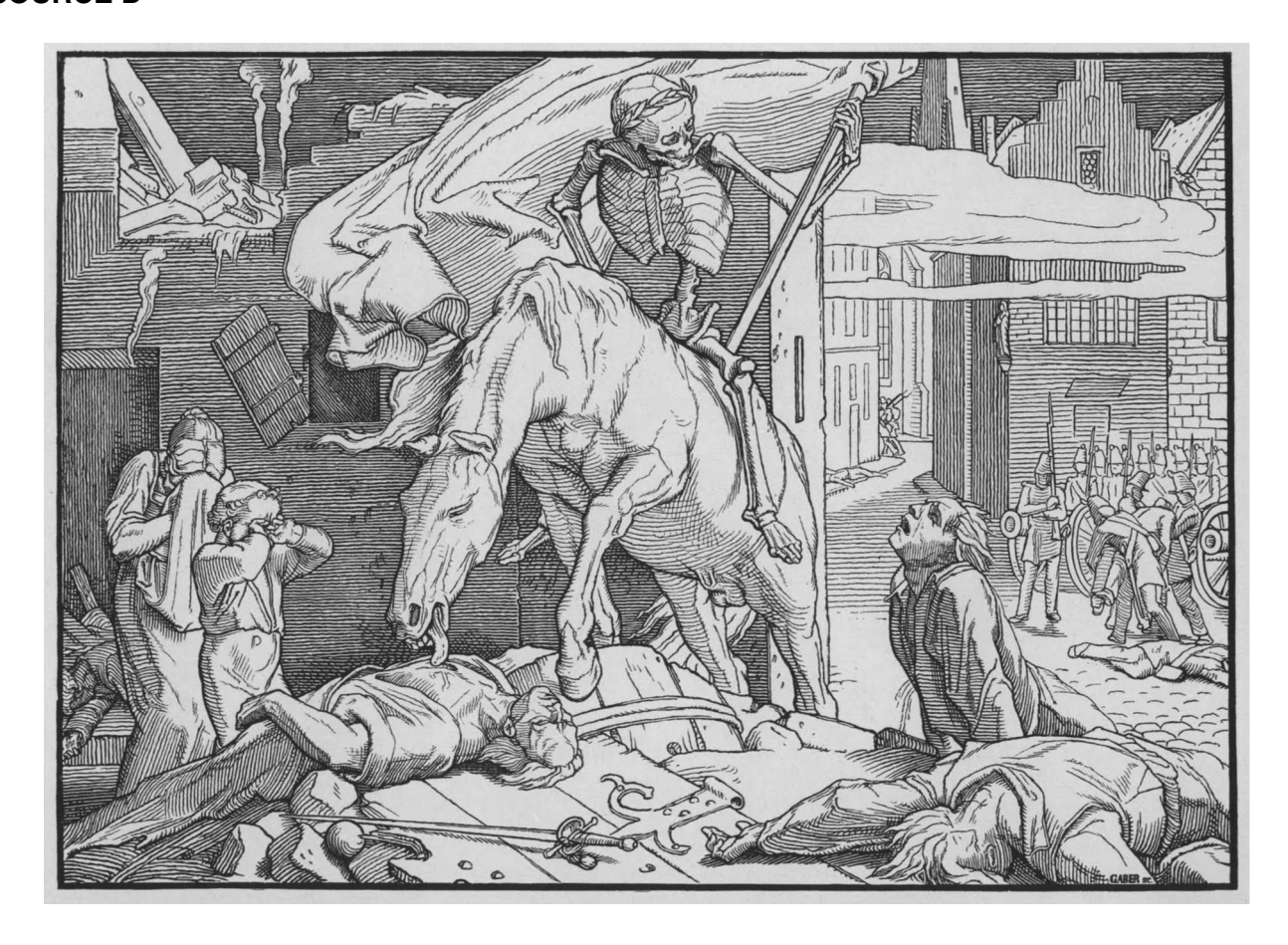
A drawing, from the time, of the disturbances in Berlin. It is entitled 'The Dance of Death, 1848'.