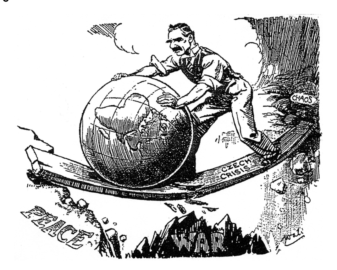
A cartoon published in a British newspaper on 25 September 1938. The man in the cartoon is Chamberlain.