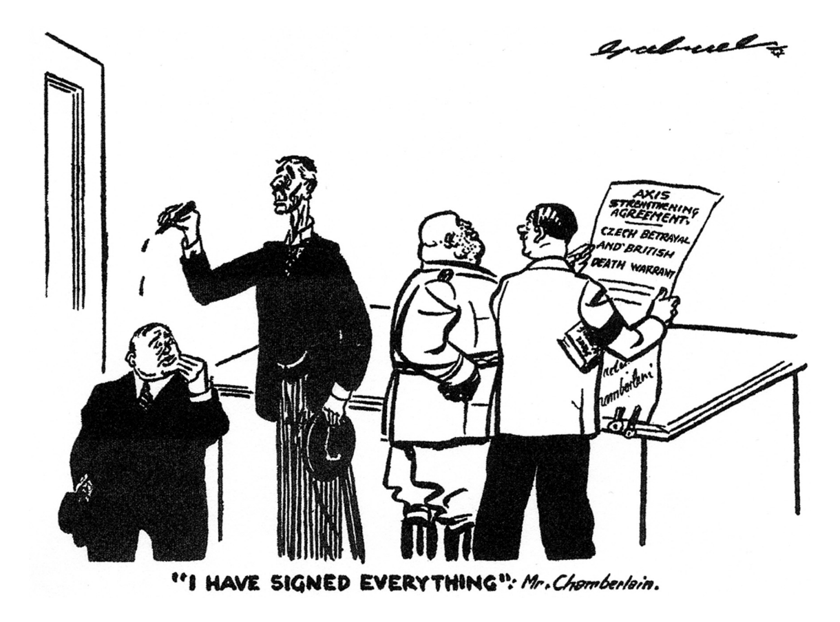
A cartoon published in Britain in a Communist newspaper on 1 October 1938. The figures on the left are Daladier (the French Prime Minister) and Chamberlain. The figures on the right are Mussolini and Hitler.