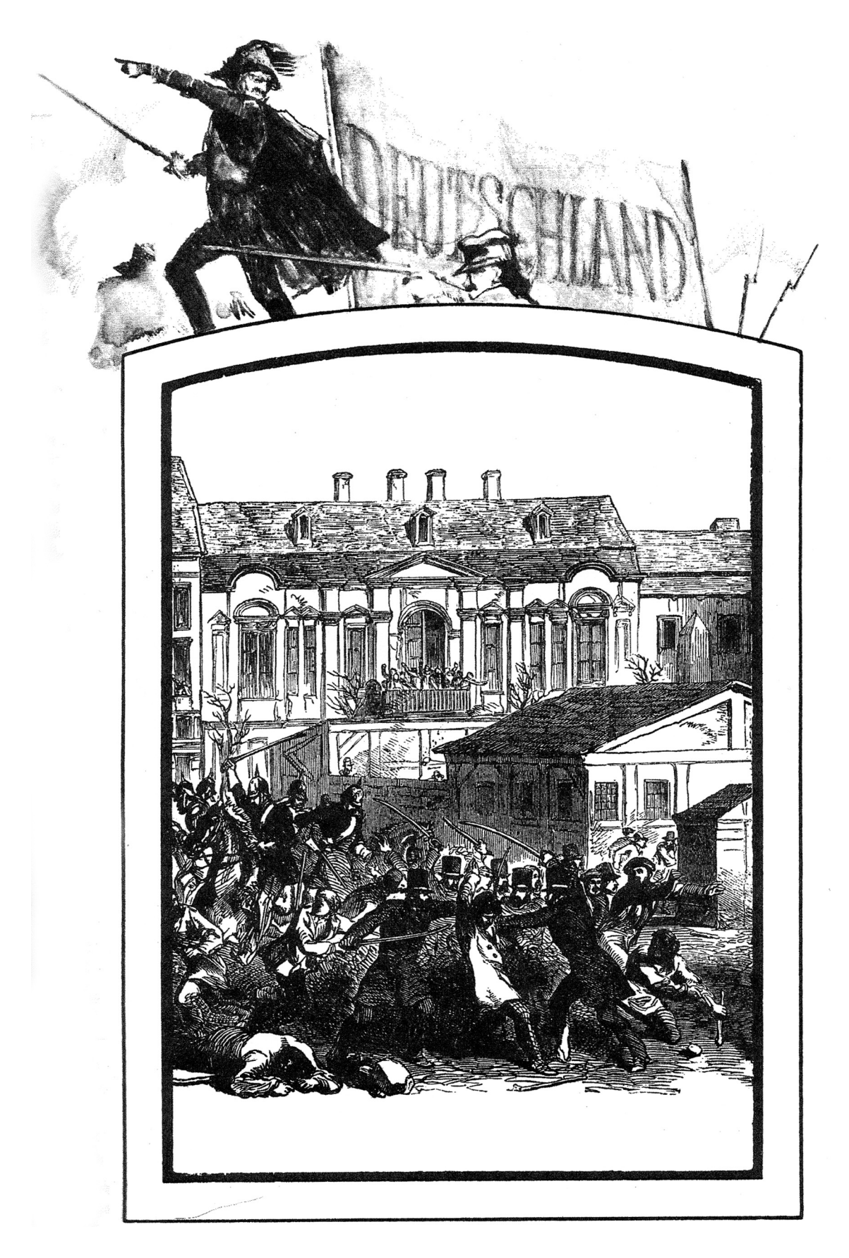
A drawing of the disturbances in Berlin, published in Britain in May 1849.