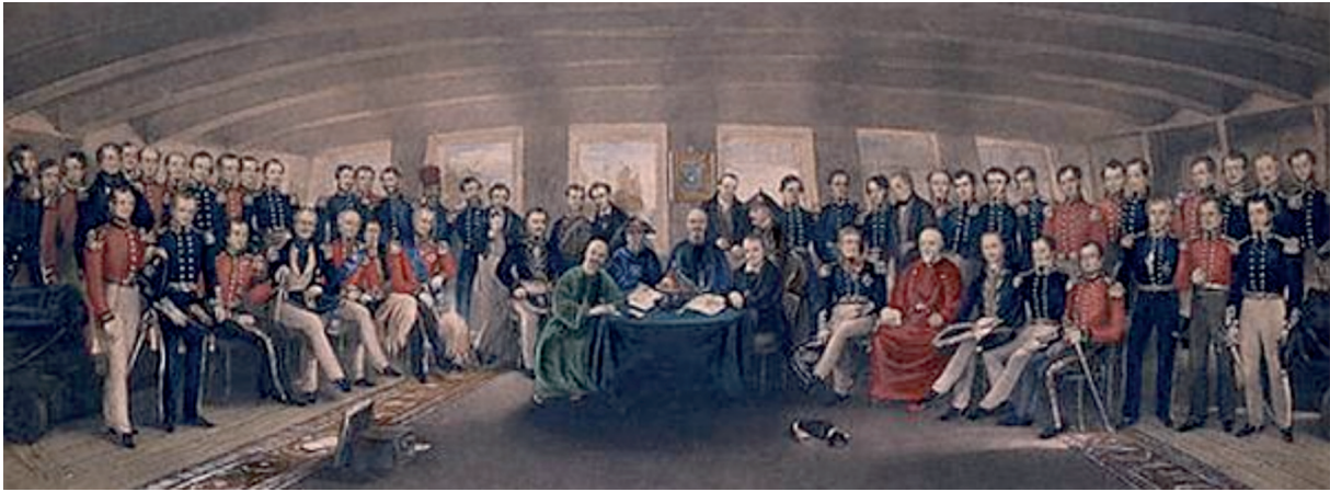
The signing of the Treaty of Nanking in August 1842. It marked the end of the First Opium War in which China suffered military defeat.

24 Look at the picture, and then answer the questions which follow.