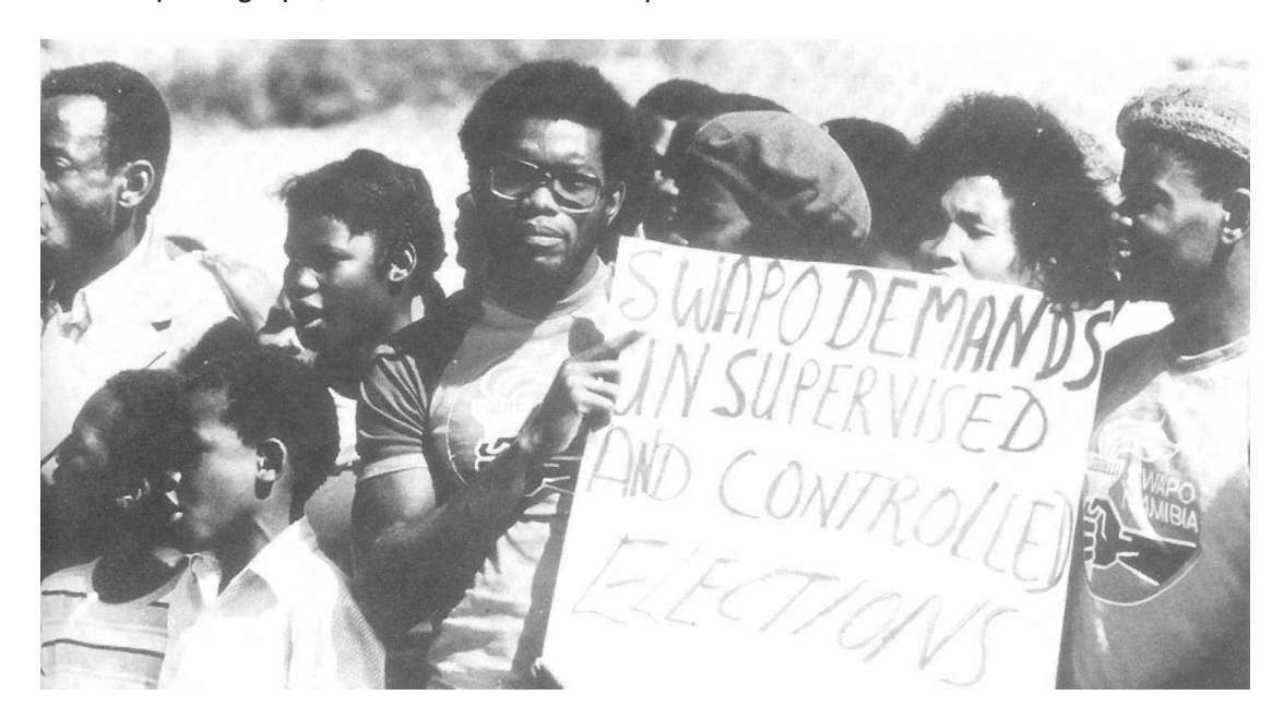
A photograph of a SWAPO protest in 1978.

19 Look at the photograph, and then answer the questions which follow.