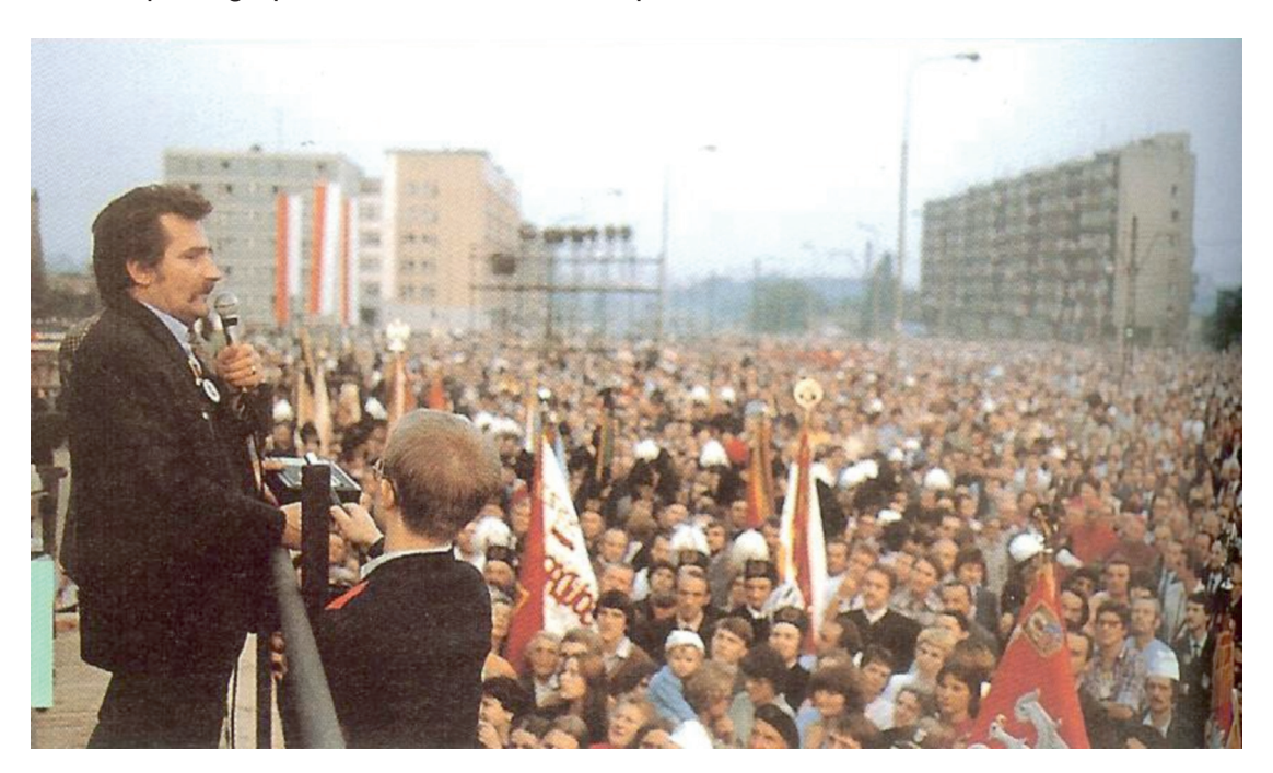
A photograph of Lech Walesa, the 'Solidarity' leader, speaking at Gdansk in 1980.