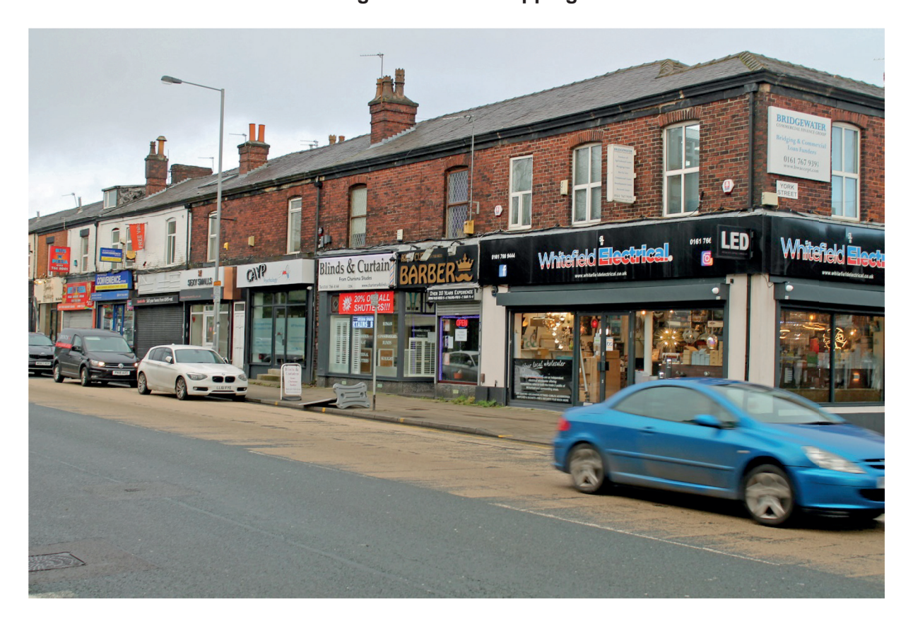
Fig. 2.5 for Question 2 Local neighbourhood shopping centre