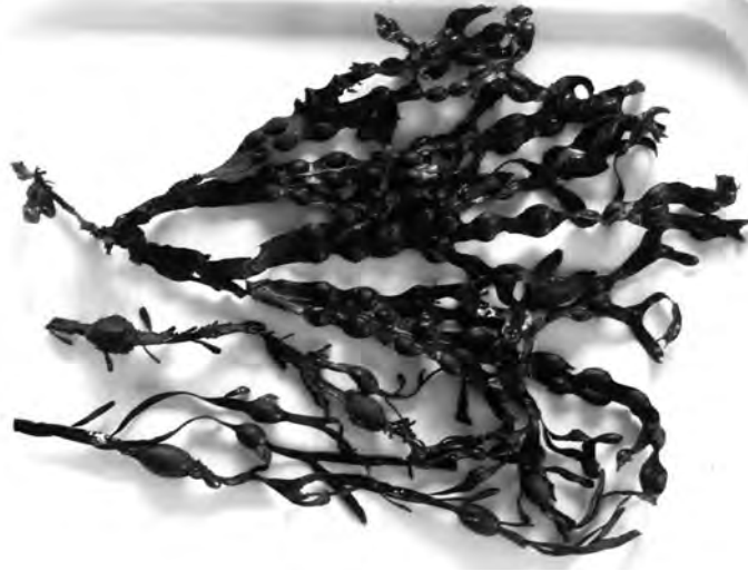
Fig. 1.1 magnification \times 0.3

An investigation was carried out to measure the distribution of two species of brown algae, Ascophyllum nodosum and Pelvetia canaliculata , on a rocky shore.